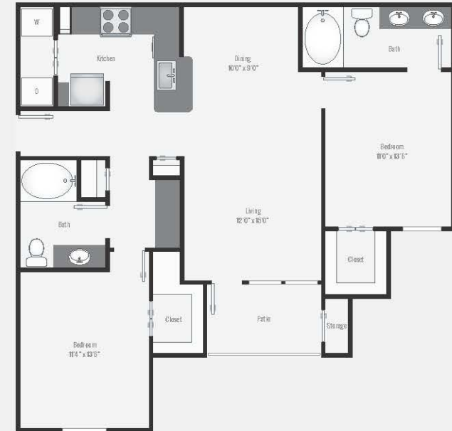
C1 3 BR | 2 BA | 1,435 SF