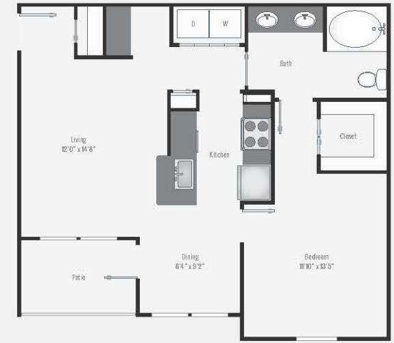
A2 1 BR | 1 BA | 888 SF