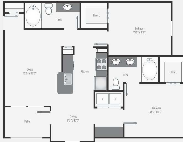
B2 2 BR | 2 BA | 1,194 SF