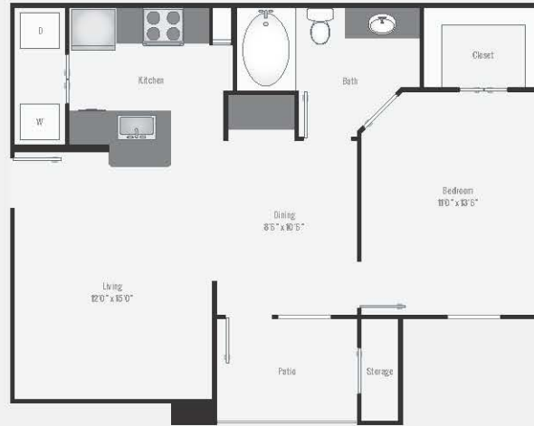
A1 1 BR | 1 BA | 821 SF

Stone Creek is a one-of-a-kind experience you simply won't want to miss!