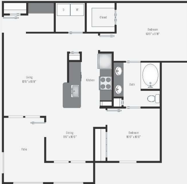
B1 2 BR | 2 BA | 1,096 SF